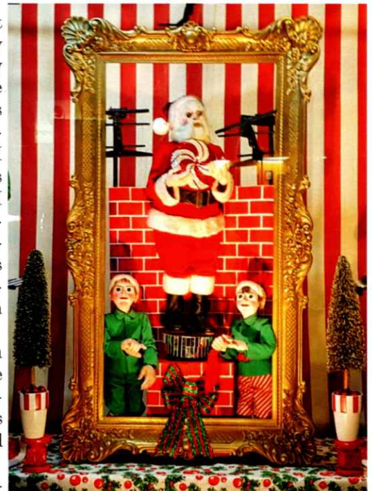
The "living window" display by Puppetry Arts Institute, as part of the Mayor's Christmas Tree lighting ceremony in Independence.

A few days before Christmas, a traveling version of "Holly Jolly Christmas" was presented at a local shelter for women and children. The festive performers brought merriment to those in time of need. The gift of puppet joy was appreciated by all.