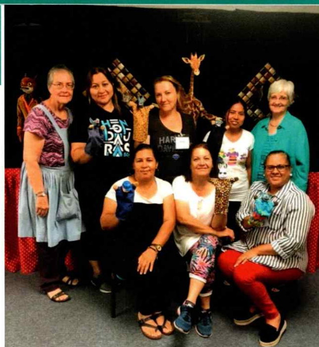
Each year PAI has provided a special workshop for guest teachers from Honduras, through the Friends United organization. This photo was taken during their September 13, 2019 visit to PAI.