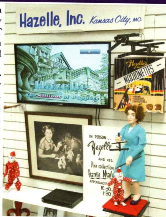
A section of the Hazelle room at PAI, which was recently upgraded with a grant from the Truman Heartland Community Foundation.